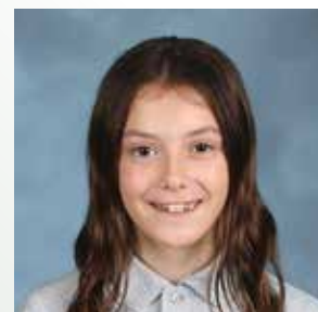
Siena Hill Grey Nuns of the Sacred Heart Award