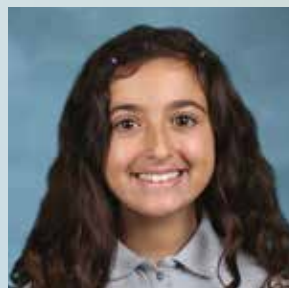
Theresa Lauria Christina Wenke Memorial Scholarship